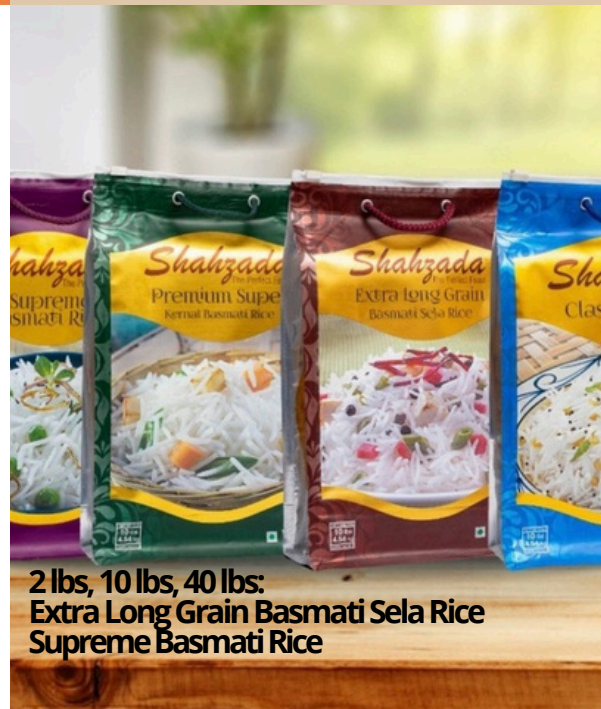
2 lbs, 10 lbs, 40 lbs: Extra Long Grain Basmati Sela Rice Supreme Basmati Rice