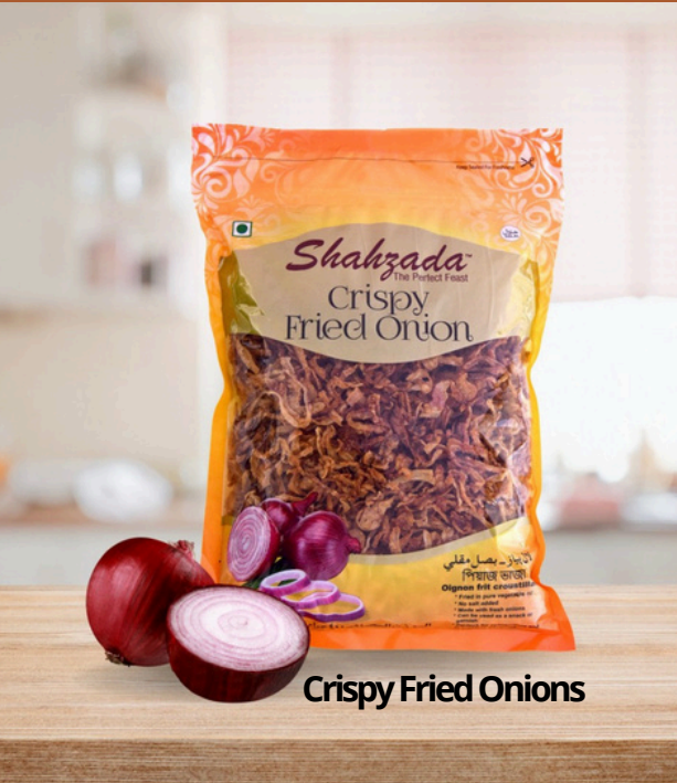
Crispy Fried Onions